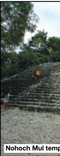
Nohoch Mul temp

There are no large temples here. This ceremonial area is lined with stelae (carved stone tablets that tell the history of the Mayans). Most of the people you'll see in this area are artists with their sketchbooks; amateur archaeologists with their Coba guidebooks; or couples just enjoying a long, leisurely walk.