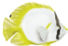
Spotfin Butterfly Fish