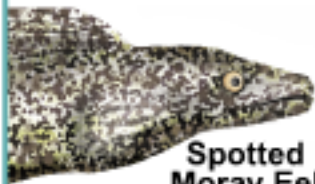
Spotted Moray Eel

Moray Eels (at left) are not rare, but you have to watch closely for them in crevices among the coral; the Spotted Eagle Ray is not rare, but it's truly a treat to watch one gracefully swim by. Nurse Sharks are not a danger to humans, but fun to see due to their size; the Blacktip Reef Shark is rarely seen, especially by snorkelers, however we have heard of sightings in the shallow water at the northernmost point of Cozumel.