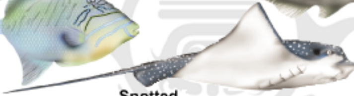
Spotted Eagle Ray