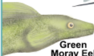
Green Moray Eel