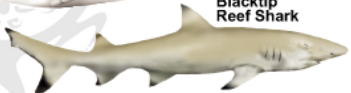
Blacktip Reef Shark